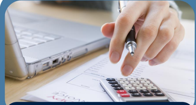
Sewer Lifeline Rate Assistance