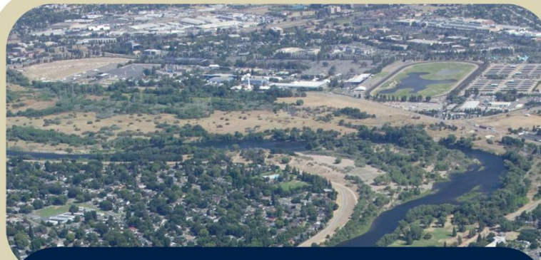
Sewer Impact Fee Waivers Economic Development