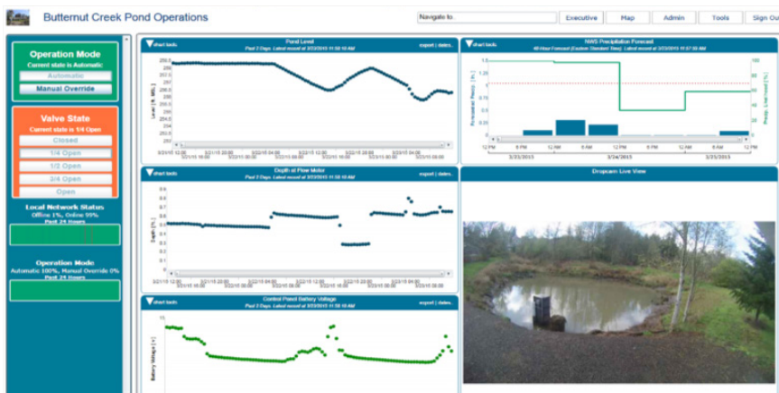
Figure 2. Smart system operational platform

On May 13, 2017 the RTC system at Bethany Creek Falls received approximately 0.58 inches of rainfall after a brief dry weather period of less than 3 hours. The RTC system was able to mitigate multiple peak rainfall–run-off events, four in excess of 8 CFS, throughout the day, while maintaining a flat flow hydrograph in the receiving stream.